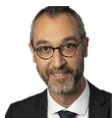
Chief Investment Officer