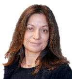
Head of Legal Affairs and Compliance