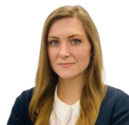
Chief Financial Officer