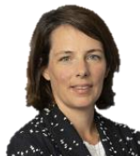
Chief Operating Officer