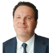
Partner & Chief Investment Officer