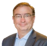
Managing Director - Private Credit