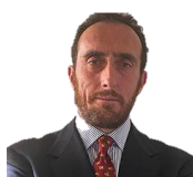
Managing Director - Private Credit Italy