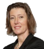
Deputy Managing Director - Private Credit