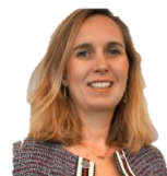
Head of ESG