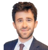
Chief Risk Officer