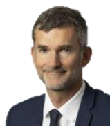
Chief Risk Compliance