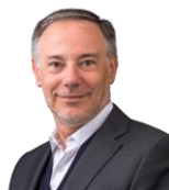
Partner & Chief Legal Officer & RCCI