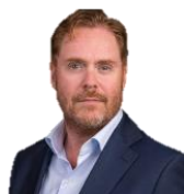
Partner & Managing Director