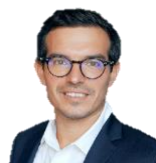
Chief Operating Officer