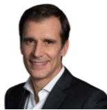
Deputy Managing Director - Private Credit